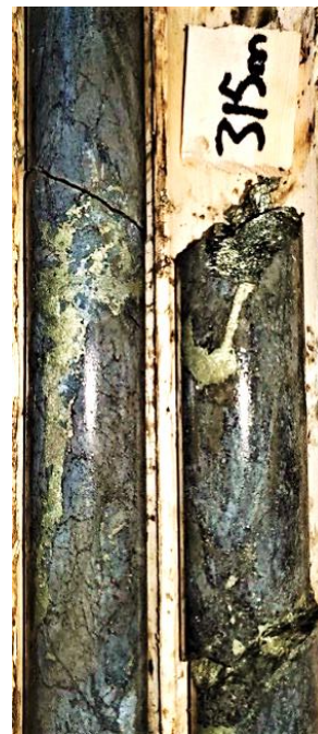
Figure 3: Stringers of chalcopyrite (copper) mineralization in Discovery drill hole 13 from within an interval which assayed 1.14% CuEq over 44.1 m

BTU Metals Corp. is a junior, mining exploration company focused on its Dixie Halo project located in Red Lake, Ontario.