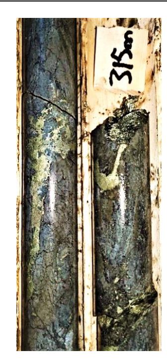
Figure 3: Stringers of chalcopyrite (copper) mineralization in Discovery drill hole 13 from within an interval which assayed 1.14% CuEq over 44.1 m

BTU Metals Corp. is a junior, mining exploration company focused on its Dixie Halo project located in Red Lake, Ontario.